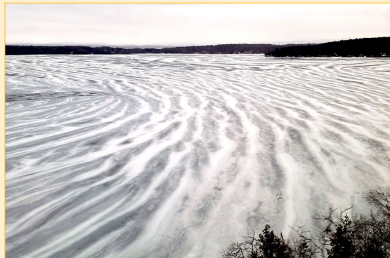
Jim Fellers submitted an image of Lake Champlain from a southbound Adirondack train.