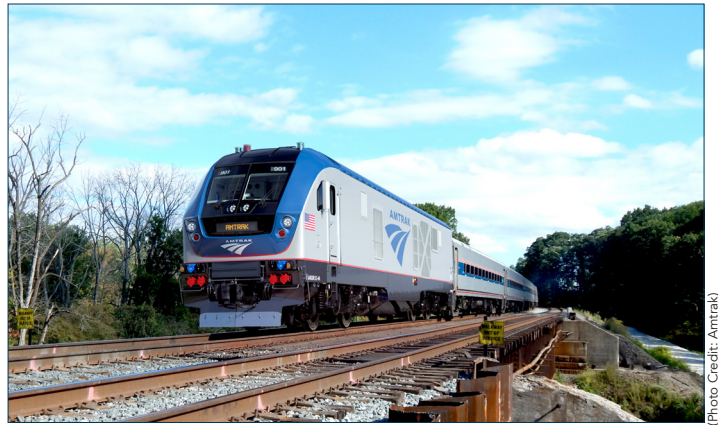
Amtrak orders 75 new Charger locomotives.

The initial order of locomotives will be used to replace the P40 and P42 locomotives on Amtrak's Long Distance train service, allowing thousands of passengers to enjoy modern technology when the trains begin service in 2021. The locomotives will power trains used on the AutoTrain, California Zephyr, Capitol Limited, Cardinal, City of New Orleans, Coast Starlight, Crescent, Empire Builder, Lake Shore Limited, Palmetto, Silver Meteor, Silver Star, Southwest Chief, Sunset Limited and Texas Eagle. Amtrak's deal with Siemens also includes the option to purchase more locomotives for use on State Supported routes and for future growth.