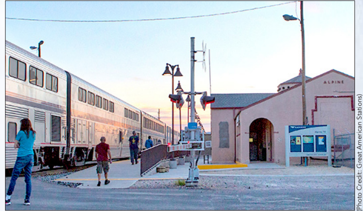
The Amtrak station in Alpine, TX.

Alpine has a great reputation of being popular with retirees who seemed to be attracted by its small