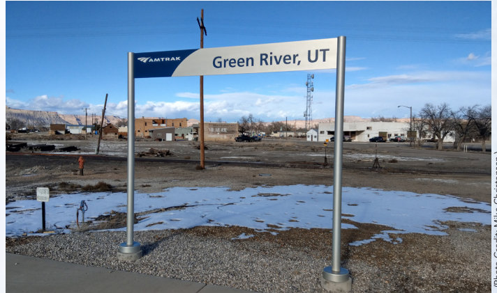
The Amtrak sign at Green River, UT.

In other words, Moab has realized that in order to continue to grow its tourist industry, more transportation options are needed for visitors. I met with the committee to introduce state-sponsored Amtrak service as an option for moving people between Salt Lake City and Moab, which was summarized by Moab Times-Independent ( www.moabtimes.com ).