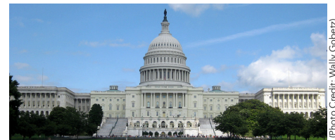
The United States Capitol.