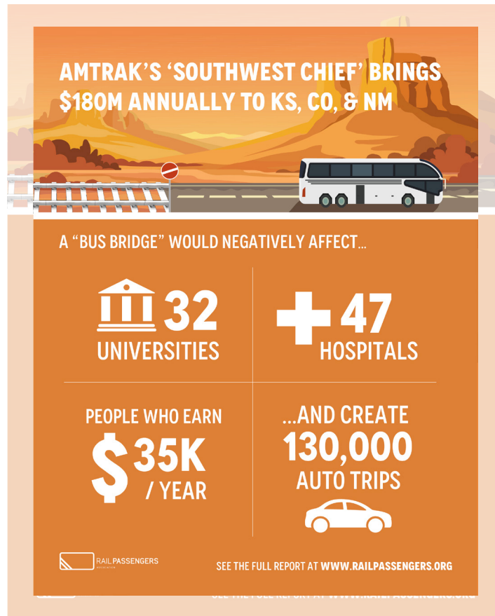
The socio-economic effects of Southwest Chief bus bridge.

These losses alone are more than three times what Amtrak requests from Congress to operate the entire route of the Southwest Chief, which runs from city to city, through eight states: Illinois, Iowa, Missouri, Kansas, Colorado, New Mexico, Arizona and California. An additional $135 million in "Temporary Direct Economic Losses" would result from the cancelled construction related to Positive Train Control (PTC), a safety technology mandated by the federal government that can remotely monitor and control of train's speed.