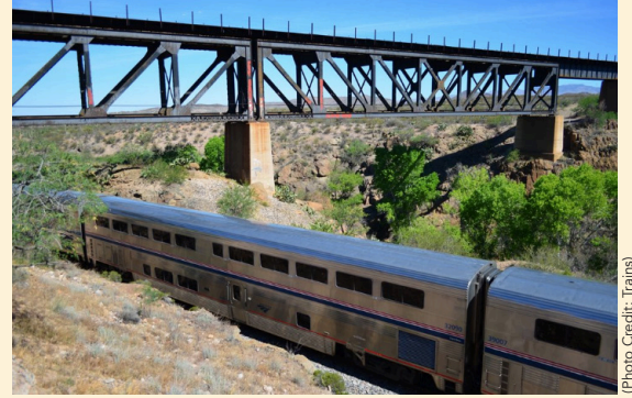
Sunset Limited along the Cienega Creek, near Tucson, AZ.