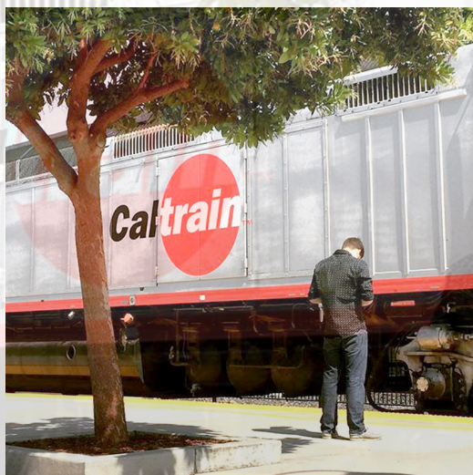
Caltrain passing by a pedestrian.

bond money. In addition, the project is estimated to create more than 9,600 total direct and indirect jobs. The program has been the driving force for the construction of a new railcar assembly plant in Salt Lake City, UT, which will generate sustainable, family-wage jobs for 550 employees. ■